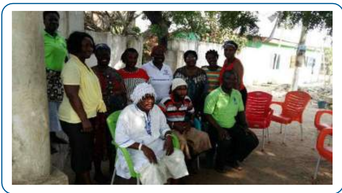
A call on the Densu Wulomo of Bortianor by Development Action Association

These women play a role in managing the marketing and pricing of fish. Like the Chief Fishermen, they play a traditional and informal role in the fisheries sector. This traditional institution is not present in all areas of the country or implemented uniformly across landing sites where they do exist. While they tend not to be adequately represented in fisheries management, in most communities they are respected individuals and are influential in providing moral authority concerning fishing practices. Additionally, women play a number of other influential roles in the fishing sector. Some women own fishing vessels and often finance fishing trips. The post-harvest sector is dominated by women who make up a large majority of the fish processors and fish marketers. Their businesses and families are adversely affected if the fishery sector is not well managed, and they have the option not to purchase illegally caught fish. Hence, the policy acknowledges the role of women in fisheries and provides for their active representation and strengthening on Co-Management Committees.