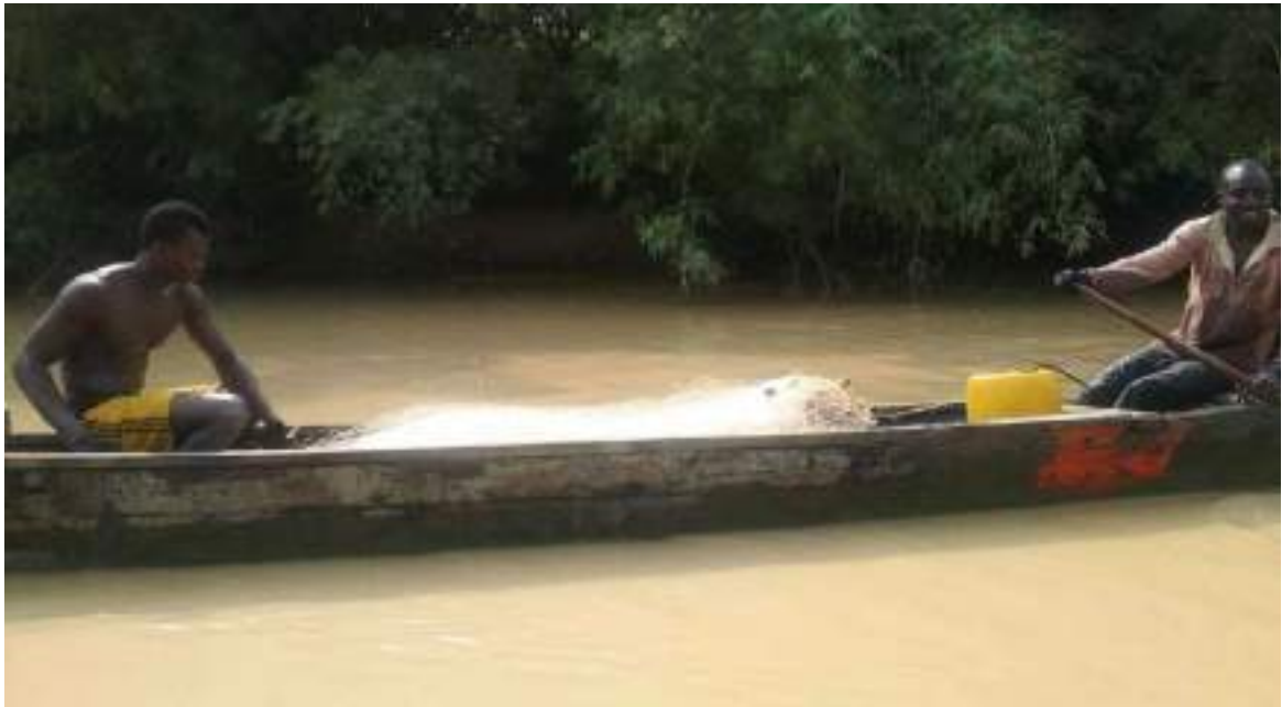
Small scale fishermen on the Ankobra estuary