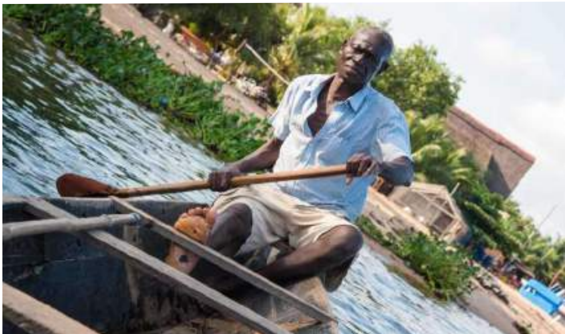
Small scale fisherman setting out on a fishing expedition on the River Volta